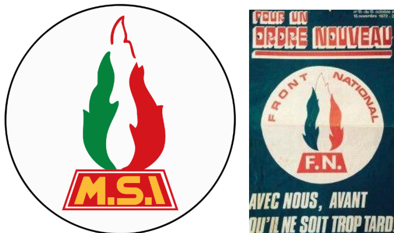
Left: MSI logo from 1947 to 1972; Right: first FN posters in 1972, financed by the MSI