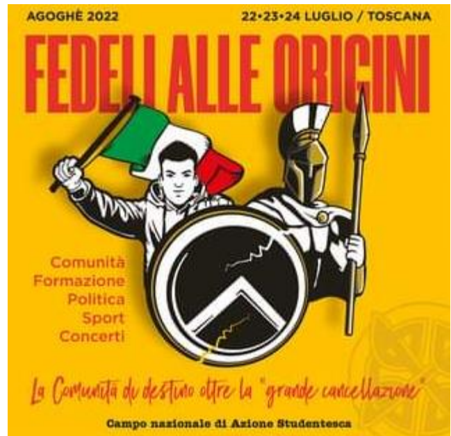
Left: A poster honoring Dominique Venner posted on the Azione Studentesca Facebook page on May 20, 2022, to commemorate the ninth anniversary of his suicide, which took place on May 21, 2013. 39 Right: The poster for an event organized by Azione Studentesca on July 22-24, 2022,

displaying the identitarian lambda symbol on a Spartan shield. 40