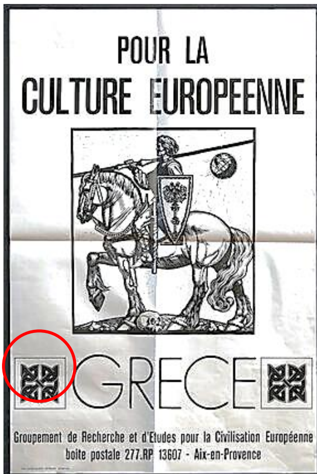
Top left: logo of Azione Studentesca.